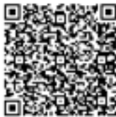
Scan code for link to automated giving.

Pledged to date: $821,857 Received in May: $18,055 Received by 5/31/2016: $450,737 Households Pledged to date: 207