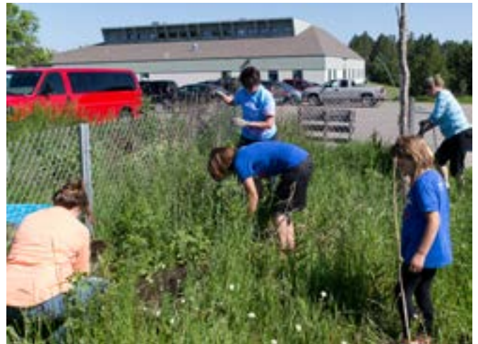
Weeding and prepping the Calvary garden for the Calvary summer childcare on Faith in Action Day, June 5, 2016