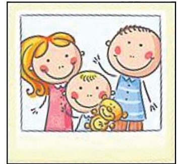
Image Photography will be here to provide everybody with their picture purchases in October. If you purchased a photo packet through Image when you had your directory photo taken, keep your eyes peeled for more information. We will announce when Image will be here to distribute photos.